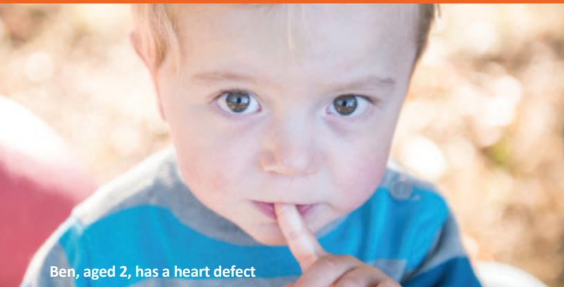
Ben, aged 2, has a heart defect